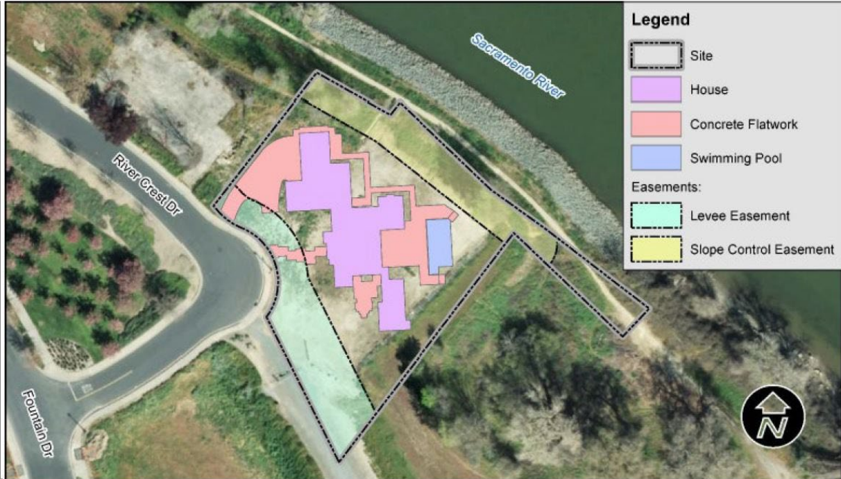
5) Ramos Trust approximate project footprint map