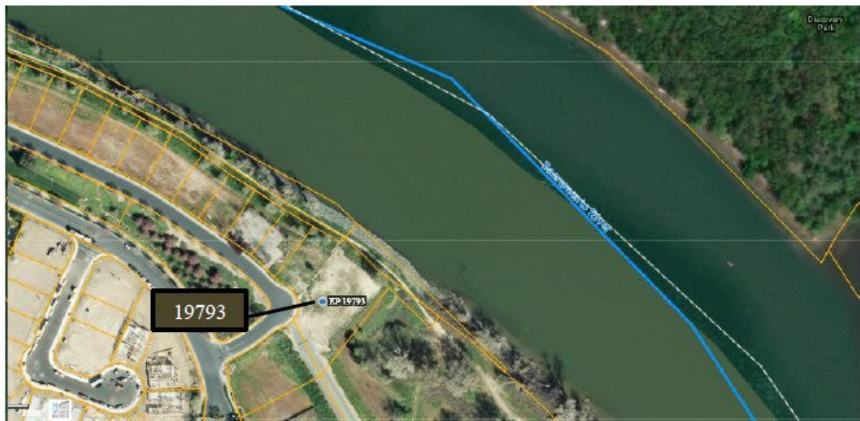
2) Ramos Trust proposed project location map